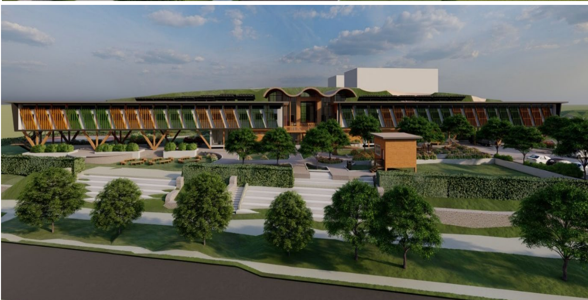
The winning design