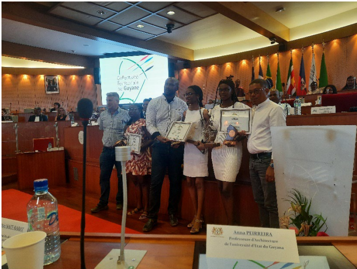
Receiving prizes in the National Assembly of French Guiana